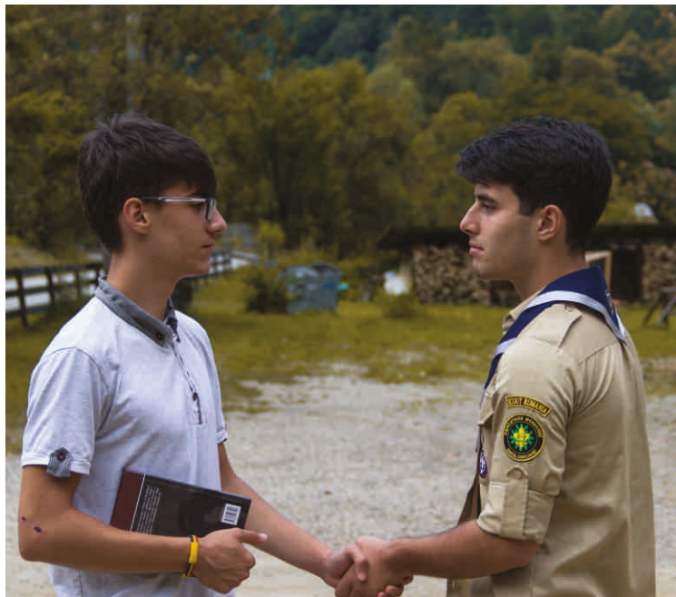
© Răzvan-Andrei, Ialomița - World Vision România | Photovoice